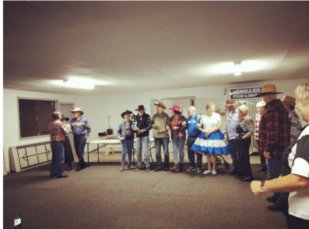
Our "Teenage" Cowboys