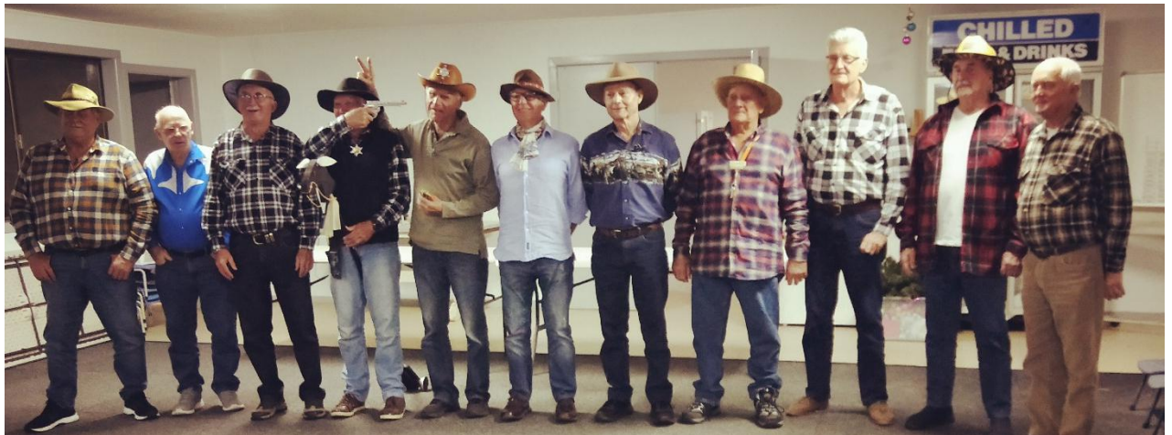
May Game Winners