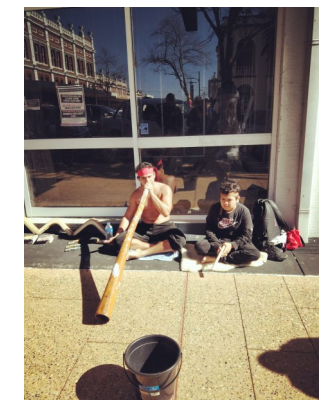
Nice to hear a Didgeredoo