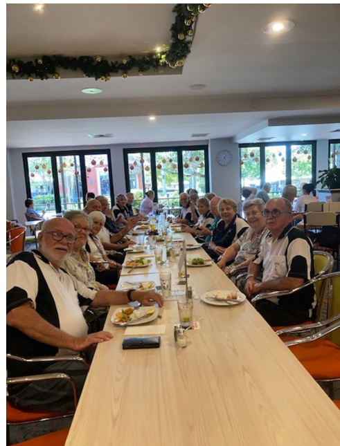
LUNCH AT THE RSL SUNSET OVER THE MOUNTAIN