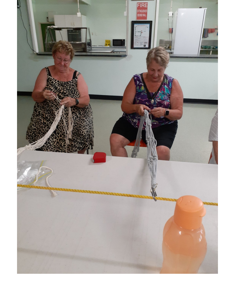
CRAFT LADIES LEARNING MACRAME