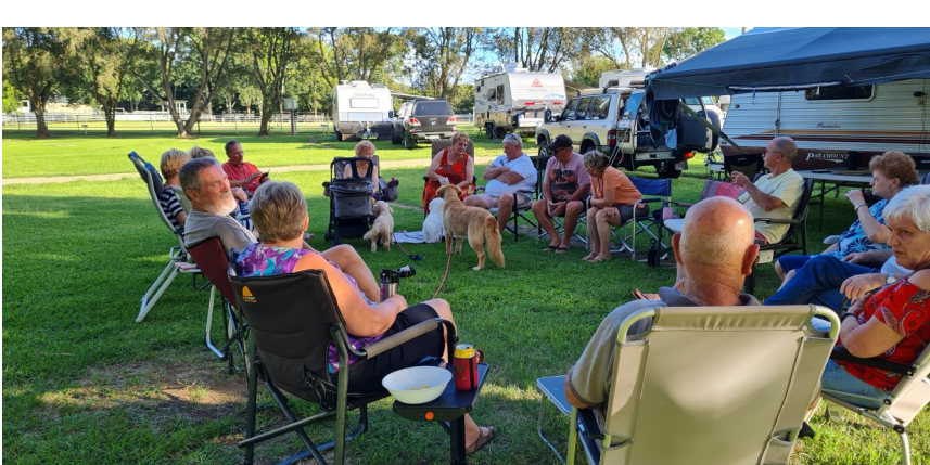
KENNILWORTH TAG-ALONG TO LITTLE YABBA CREEK