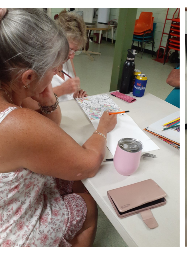
CONCENTRATING ON THEIR COLOURUNG IN