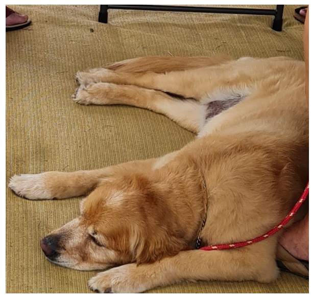
I'M DOG TIRED WITH ALL THAT WALKING