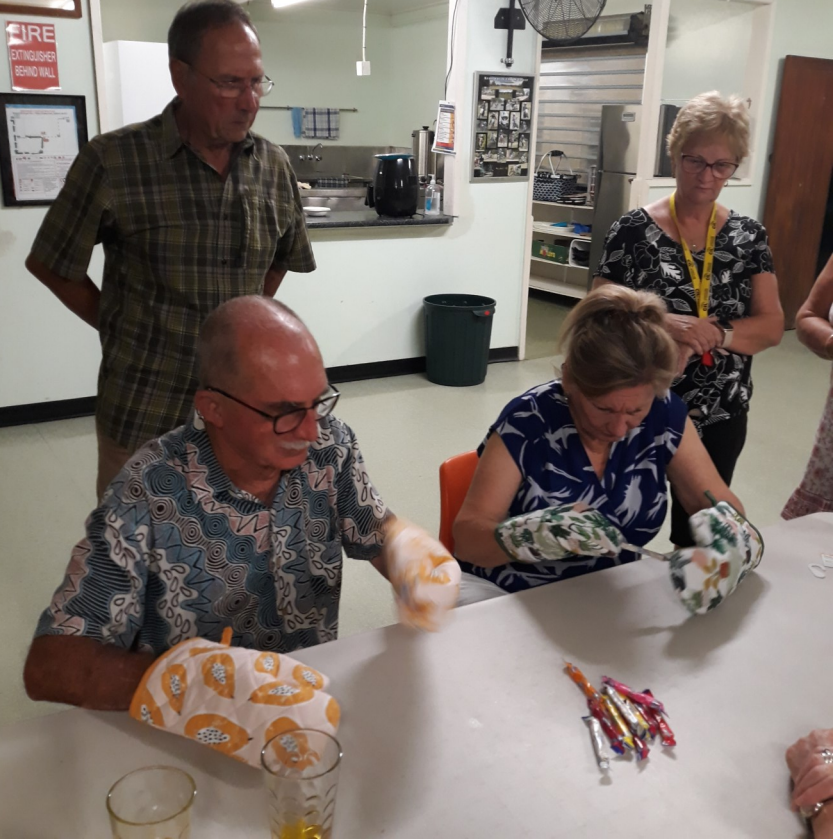
HOW DO YOU OPEN LOLLIES WITH OVEN MITT FINGERS?