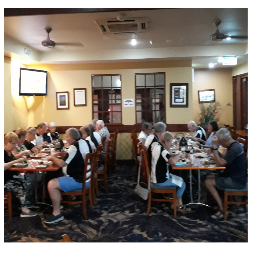
DINNER AT HYSTORIC BEERWAH HOTEL