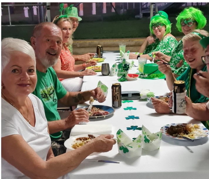
St Paatricks Day Madness