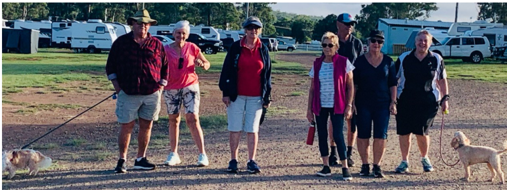
Morning walk with doggies.