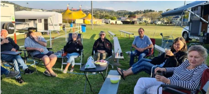
This is the life.....bring on retirement