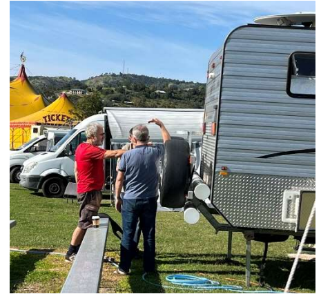
Major construction discussions