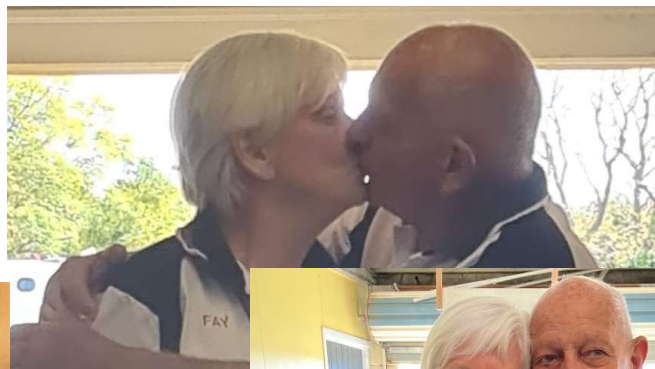
Get a room you two!