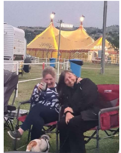
Awww....I knew she liked me really