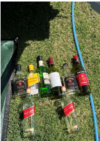
Hmmm....I wonder who's van that is....someone has a problem!