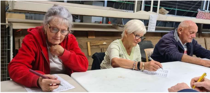
Eyes Down.....serious business Bingo!