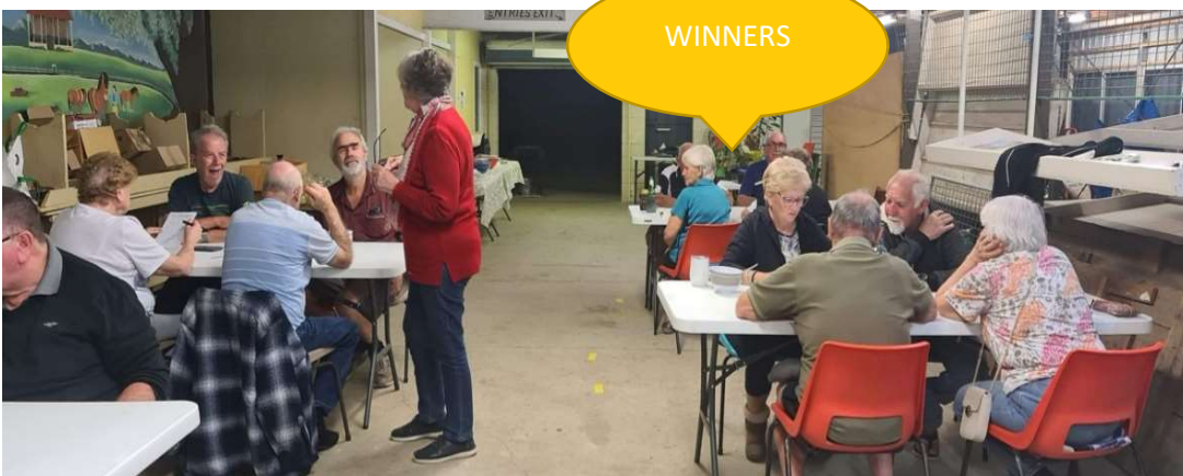
"IN PERFECT UNISON"