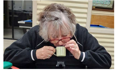
Partners in crime!

As usual, the weather played a part in the proceedings.....with blustery winds and quite chilly nights. Although that did mean we could have a fire which was excellent.