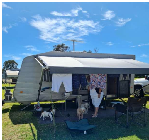
Doggy Daycare at Stanthorpe