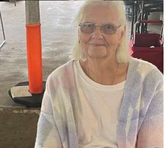
Some of our retired members