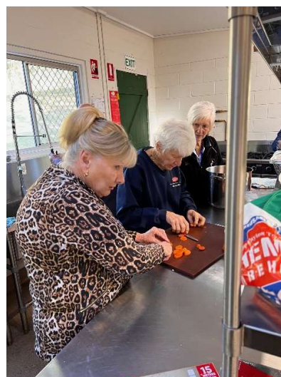
Someone definitely spiked the wine!