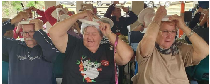
Look what happens when I'm away....people forget they are meant to eat off their plates, not use them as hats!