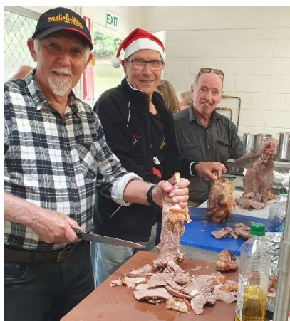
This looks like a dodgy crew to have in charge of sharp knives!