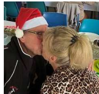
Did someone spike the mulled wine?