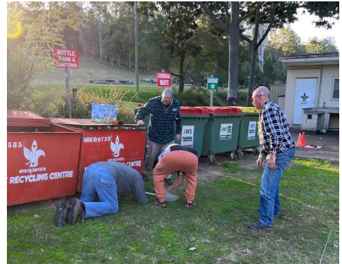
Is this some sort of new member hazing ceremony?