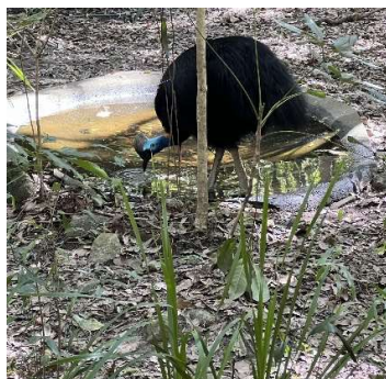
Forget about Platypus....these suckers are extremely hard to see in the wild!