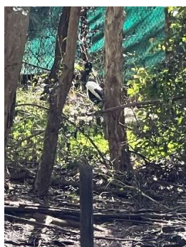
Spot the Jabiru

Now we all know the saying "What happens on tour stays on tour" .....I will say nothing except Hotel Euramo, best (and most expensive) free camp EVER!