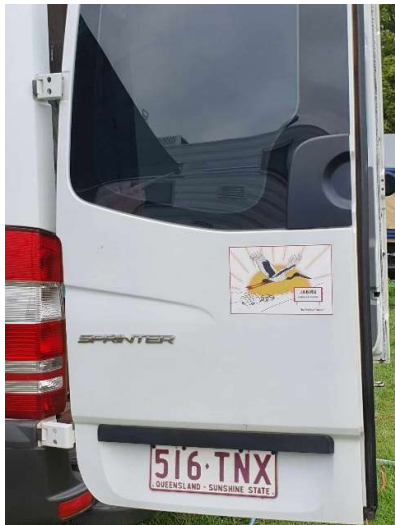
New sticker already in place