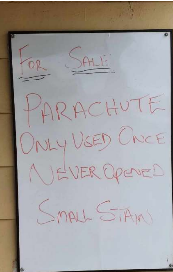
Sign outside the Camping & Fishing shop