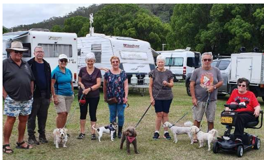
"IN PERFECT UNISON"