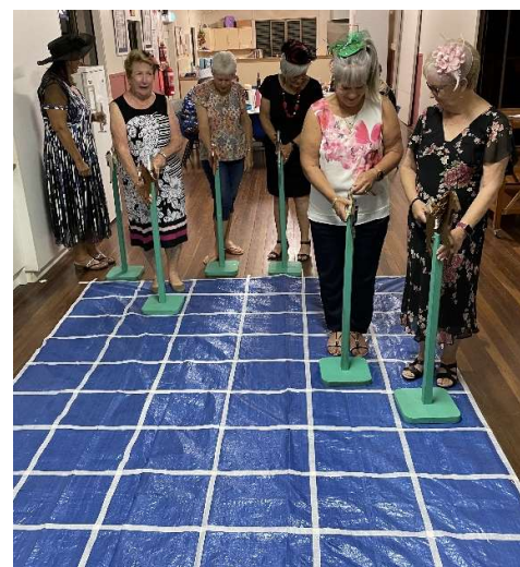
Horse 1 is still in the barrier!