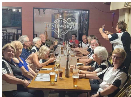
"IN PERFECT UNISON"