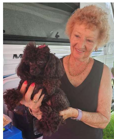
Happy Birthday Luna