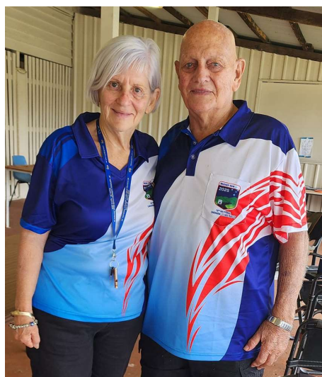
Modelling the 2025 National Rally Shirts?