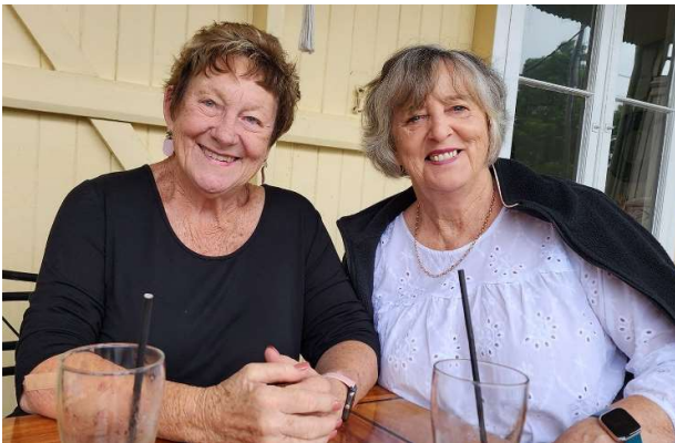
Looking good ladies