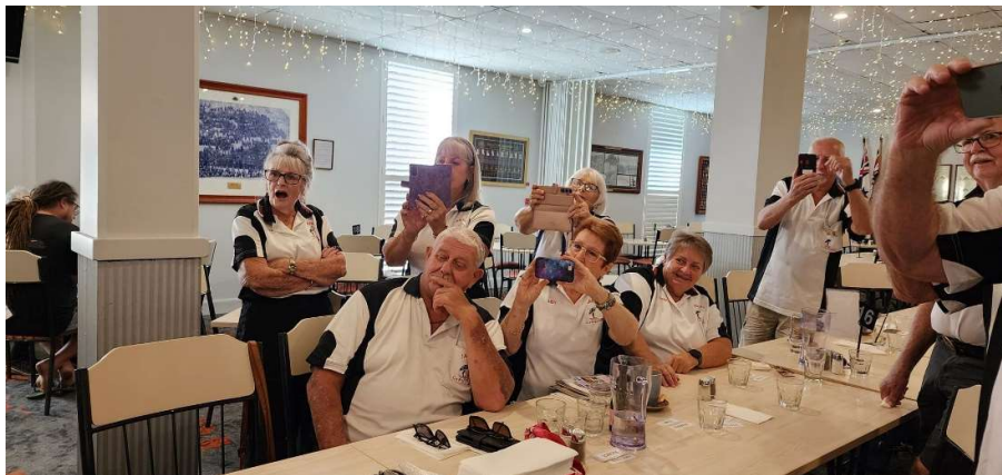
Hmmm.....interesting.....something must be happening at the front of the room!