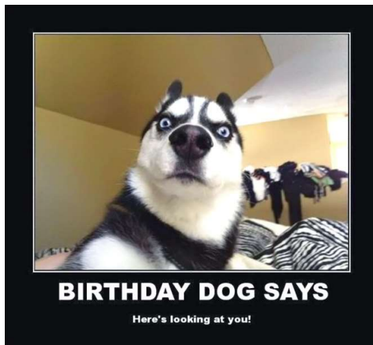
BIRTHDAY DOG SAYS Here's looking at you!