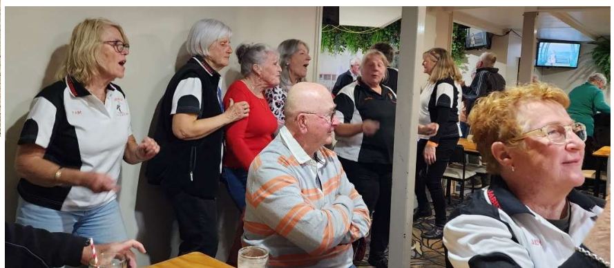
"IN PERFECT UNISON"