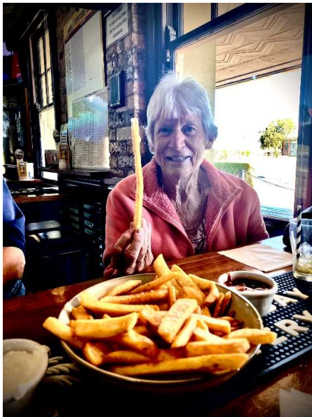
That is certainly a large chip!