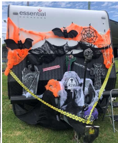
Winning van decorations