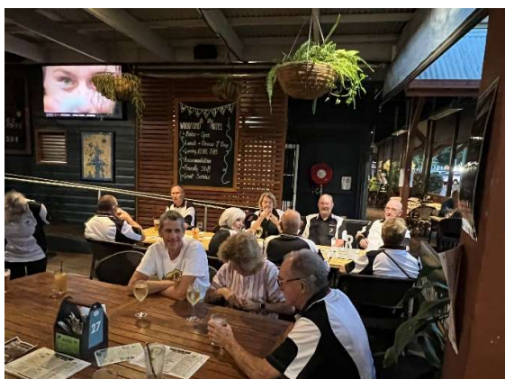
"IN PERFECT UNISON"