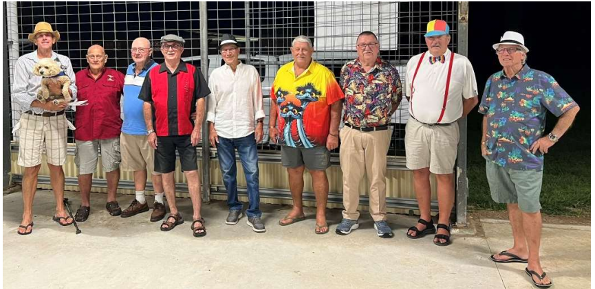
It was like herding cats getting this rabble to line up!