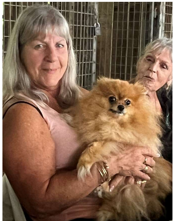
The puff balls came out for a visit