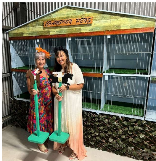
Parading the Bird Cage!