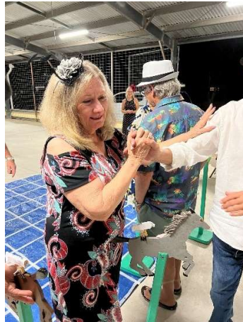
This is a bit suss....the jockey is very familiar with the punter!