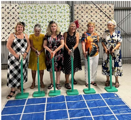
A fine field of fillies