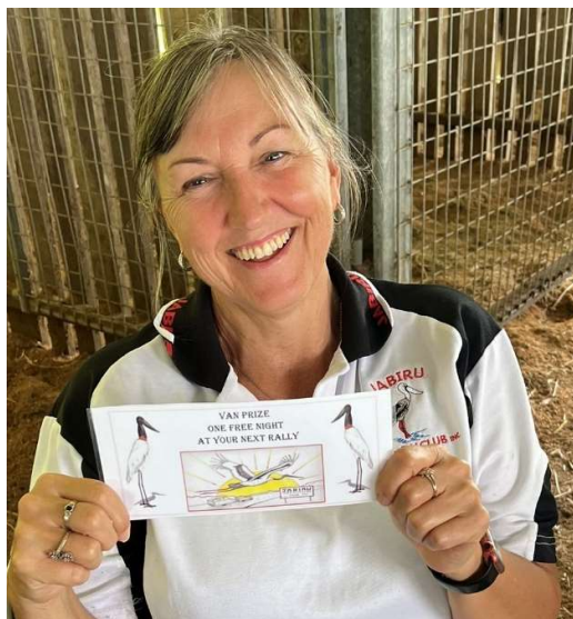
GUESS WHO won the Lucky Van Prize.....FINALLY!!!!