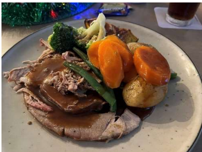
For those who didn't make it to the Christmas Rally.....here's what you missed out on! (not that I'm rubbing it in or anything)