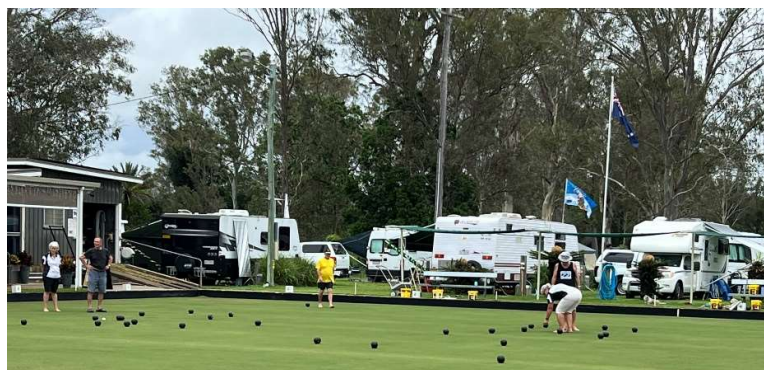
"IN PERFECT UNISON"