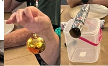
I'm not sure Sandra & Bob even deserve a participation badge for these centrepiece efforts!