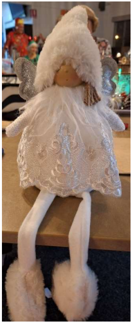
This Secret Santa gift did the rounds!