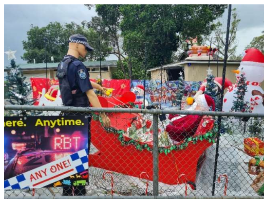
Imbil Police Station Christmas Decorations