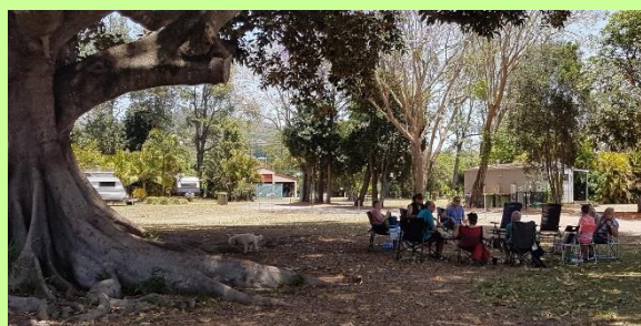
Happy hours were spent under the shade of this Moreton Bay Fig.

After a thunderstorm on Saturday evening we all ventured to the local Railway Hotel for dinner –