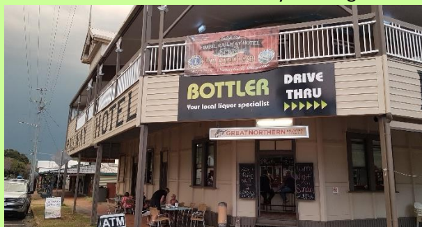
"IN PERFECT UNISON"

After a thunderstorm on Saturday evening we all ventured to the local Railway Hotel for dinner –