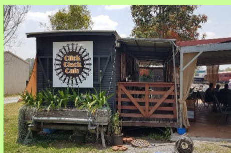
A rustic looking café – Click Clack Café