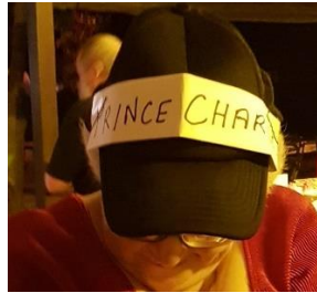
and partners game