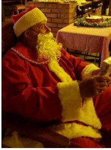
Santa arrived to give us pressies and cut our Christmas Cake