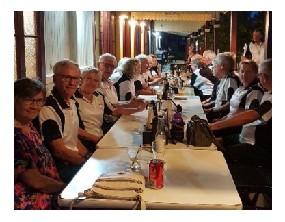
<u>Friday night</u> we visited the Local Crown Hotel for our evening meal.