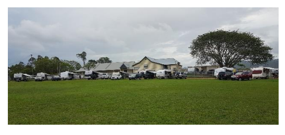
<u>Saturday</u> we went for a drive to Mt Mee Lookout and Woodford for morning tea and some of us had lunch in Woodford.