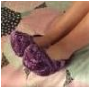
Jeanette has been busy knitting socks