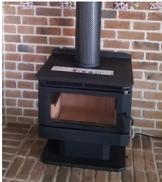
New fireplace in home