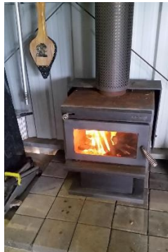
Fireplace in shed