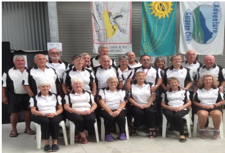
National Rally Albany 2019