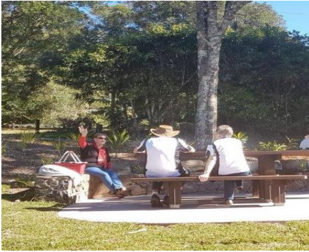
Outing and lunch at Maiala D'Aguilar National Park