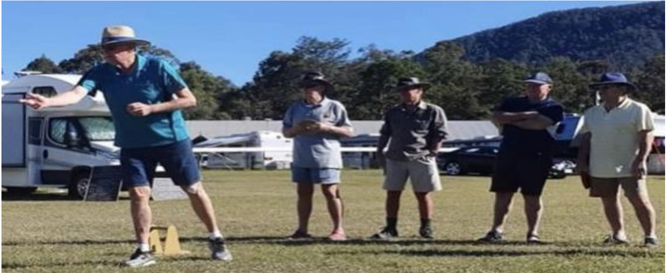
Enjoying a friendly game of disc bowls with The Wanderers Motorhome Club