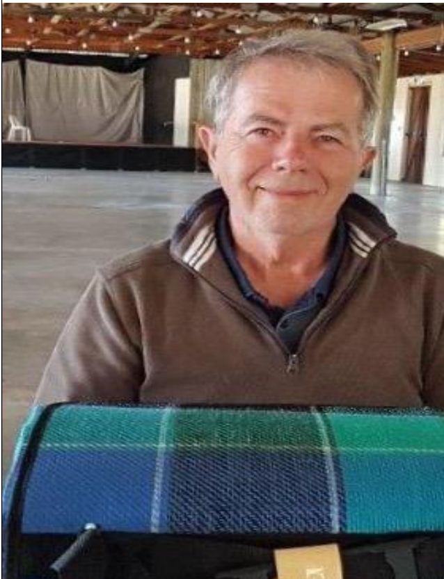
“IN PERFECT UNISON”