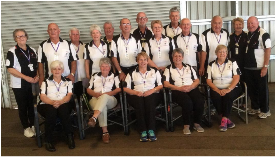
National Rally Canberra 2016