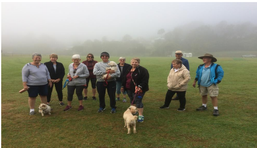
Foggy start for our walkers