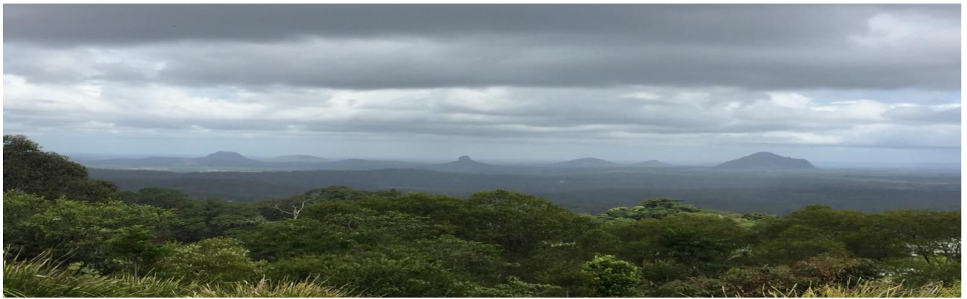
Misty view from Mary Cairncross Park