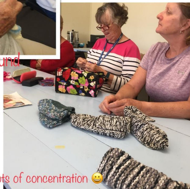
All very quiet, just lots of concentration 😊