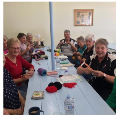
Jabirus Crafting Around