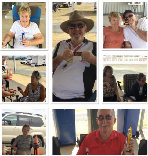
Left: Chocolates for those who handed in their Crossword Forms.