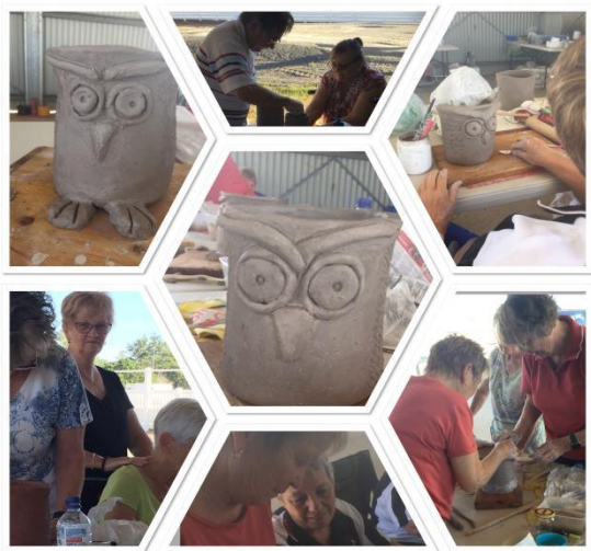
Everybody concentrating so hard on creating their pottery masterpieces