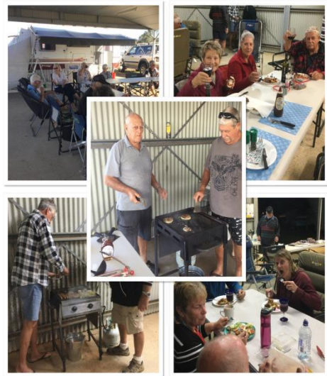
Right: Looks like all we do is eat. Meal times over the weekend and pancakes on Sunday