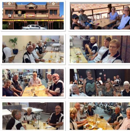
Enjoying lunch at the Exchange Hotel