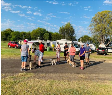
Early Morning Walkers enjoying the day with their Dogs