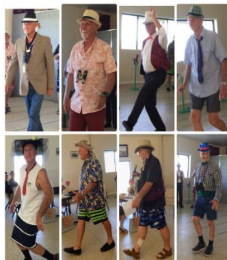
The Young Colts