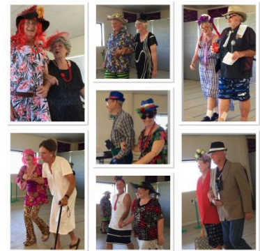
The Motely Mates