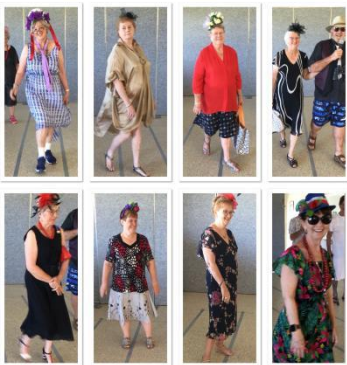
The Attractive Fillies