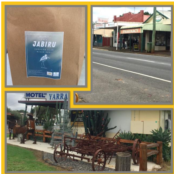
A few snaps around Yarraman and the surprise Welcome Bag from the Caravan Park with brochures & chocolates.