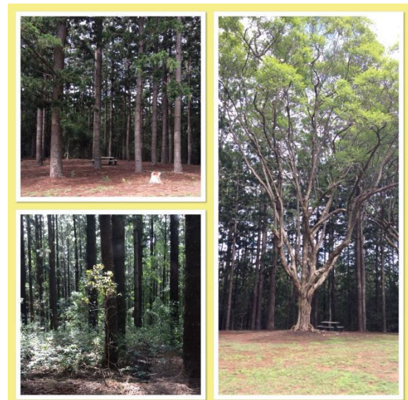
A few photos taken in Yarraman State Forest.