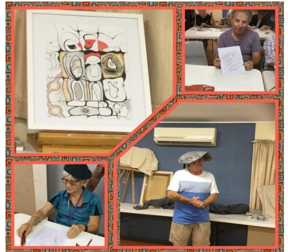
Picasso and his cubism art class. A very interesting art history lesson.