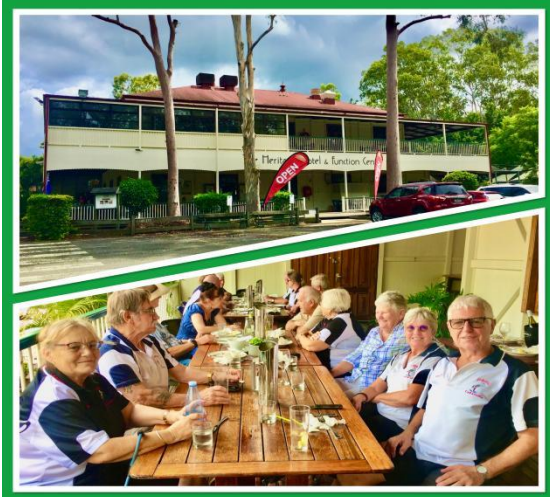
Members enjoying lunch at Petrie Heritage Hotel at Old Petrie Town. A really beautiful old historic building.