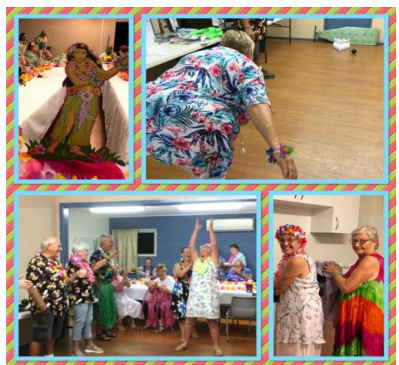
Working off the dinner with a lively game of skittles and of course our clean up ladies. Thank you to all for making this another successful night.