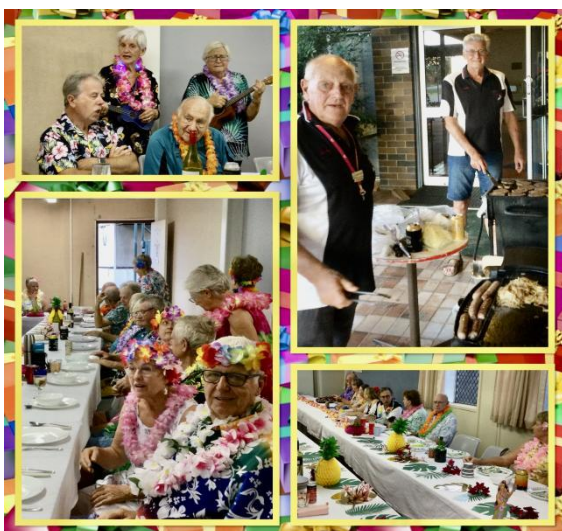
Our lovely Hawaiian themed dinner, from the cooks to the entertainers and the members in their themed outfits. Well done everyone!